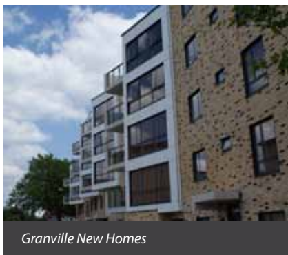
Granville New Homes

The University of East London is pursuing a study to determine the energy efficiency of Granville New Homes.