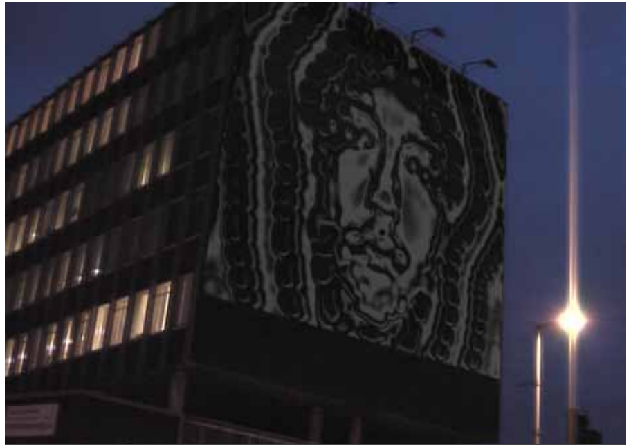
Visual Art Improves the Look of Wembley

There are also discussions with the Architecture Foundation, a national body, about turning the former South Kilburn Partnership offices into a new community space until the Healthy Living Centre planned for the site arrives. The Foundation has run a number of similar projects using derelict spaces, including Southwark Lido, the Urban Bankside Orchard and