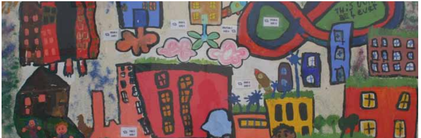
The mural painted by local children now on display at Albert Road