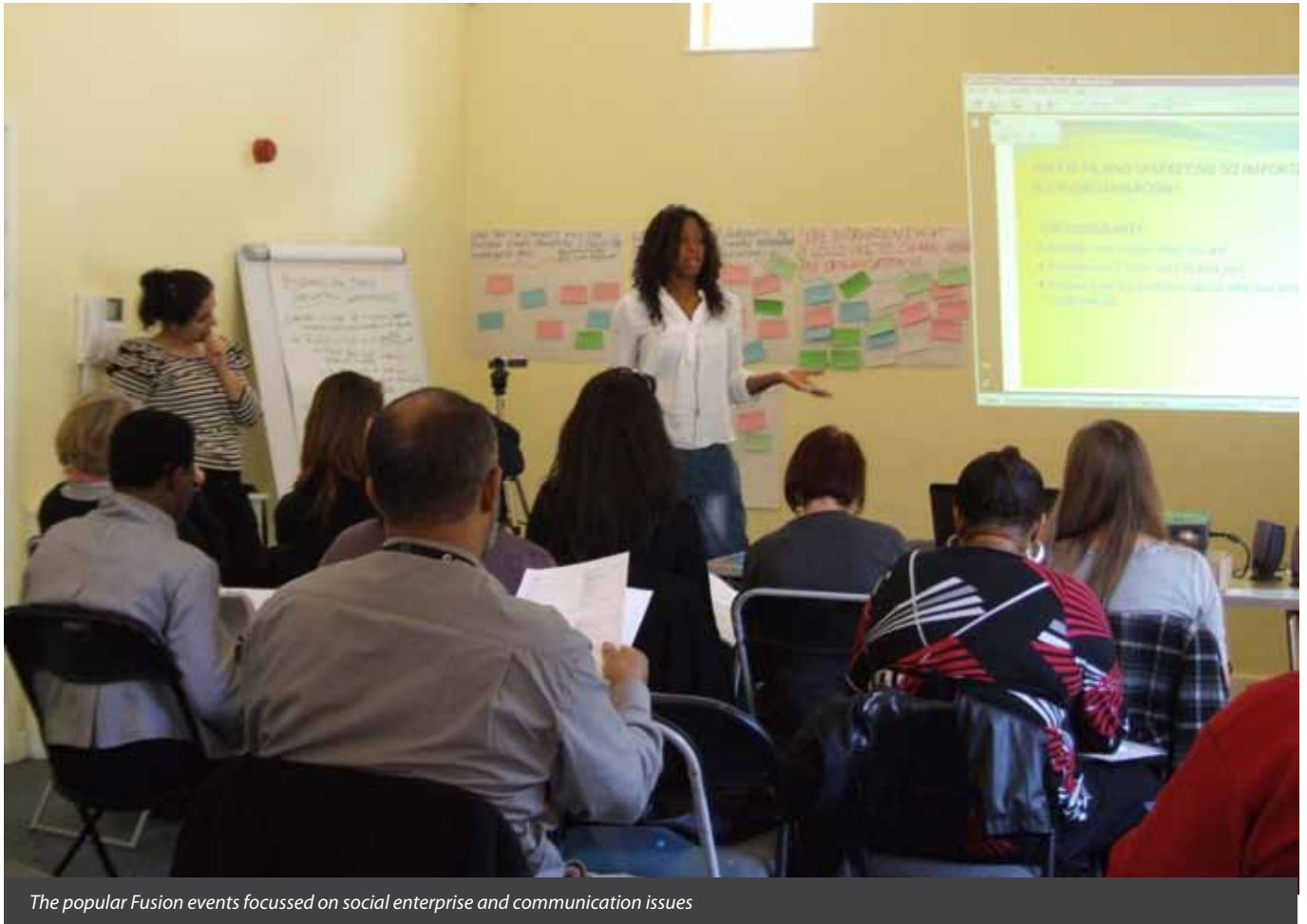
The popular Fusion events focussed on social enterprise and communication issues

Fusion has run two recent events in South Kilburn about social enterprise and communication.