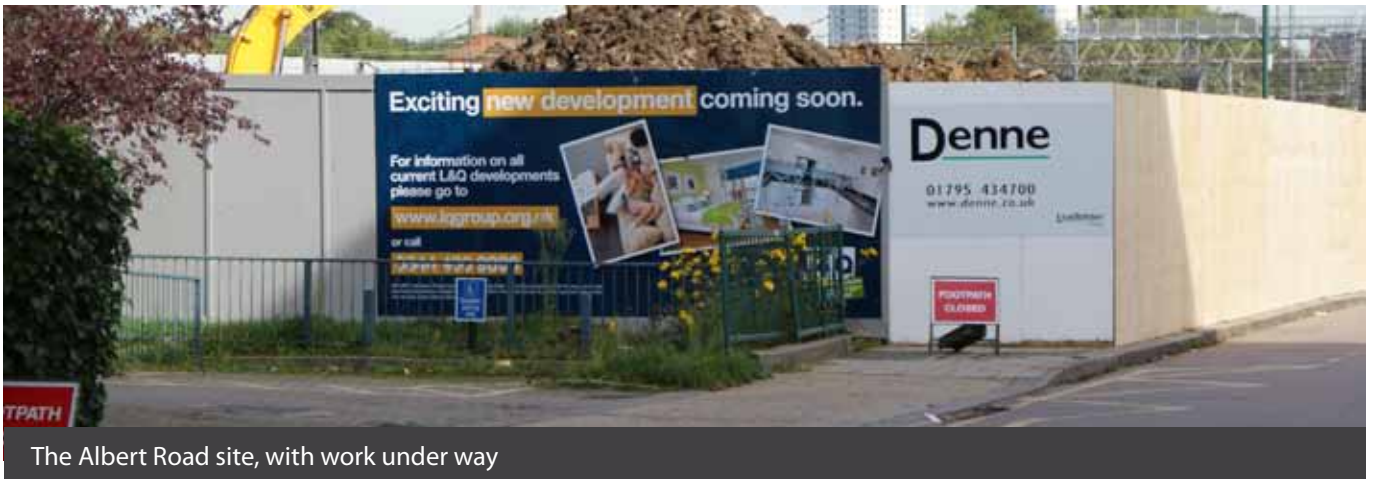
The Albert Road site, with work under way