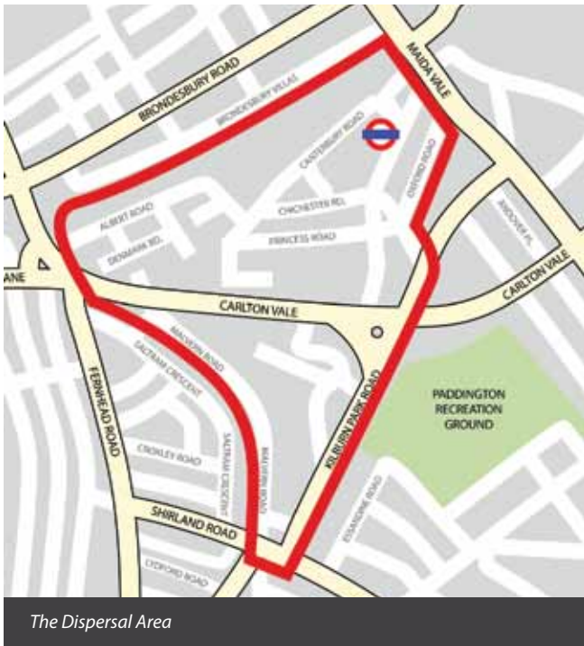
The Dispersal Area

Since 16th August this year a “Dispersal Area” has been in place around the South Kilburn Estate to combat Anti-Social Behaviour (ASB). This runs until 16th November.