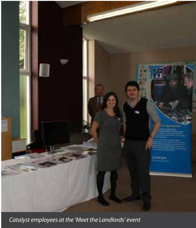
Catalyst employees at the 'Meet the Landlords' event